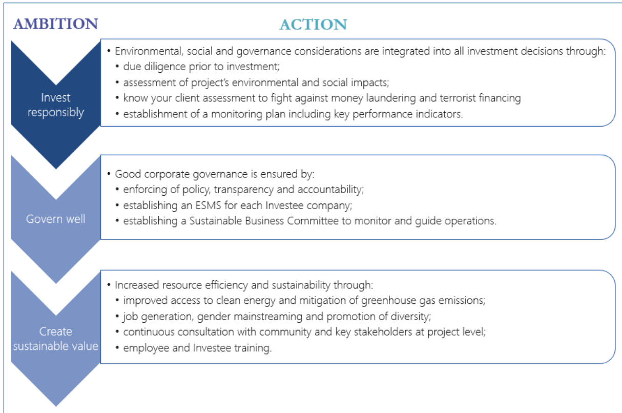
Figure 2: Summary of Camco's sustainability ambitions and actions

Through periodic internal training, Camco ensures employees' awareness and understanding of its policies and procedures. Similarly, Camco Investee companies go through a policy onboarding process to ensure awareness of the requirements made on them. Investees' compliance with the policies is ensured through periodic monitoring and reporting of key performance indicators, and their performance against their ESMSs and parameters identified in their Gender Action Plans.