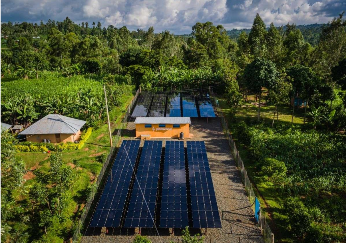
Solar PV mini-grid, Kenya

commercial operation by 2019 resulting in the mitigation of 4,205 metric tonnes of CO 2 equivalent (tCO 2 e) and the connection of over 170,000 people to electricity for the first time as a direct result of REPP intervention. More information on REPP-supported projects and their impacts is available at www.repp.energy/projects and www.repp.energy/publication-type/annual-reports .