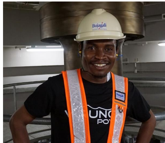
Employee at hydropower plant, Uganda

Camco conducts an annual Making Camco Better staff survey on the quality of work life and how to improve the company's working culture. The survey has had an overall participation rate of 100% and shown that the majority of employees find their work meaningful and impactful and that they enjoy the