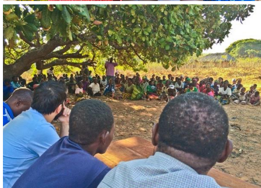
Community engagement, Tanzania

Camco monitors the fitness of this process through periodic monitoring reports and annual reviews. In addition, Camco's Whistleblowing Policy and associated hotline presented under section 2.5. provides an opportunity to report on miscarriages of justice, health and safety risks, and any breach of legal or professional obligations.