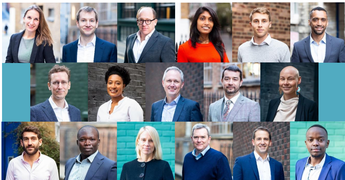
The Camco team

Furthermore, Camco has taken a proactive approach to the COVID-19 pandemic to ensure employees' and stakeholders' health and safety globally. In March 2020, Camco implemented a work from home policy, encouraging all team members to use virtual meeting facilities and restrict travel to absolutely essential journeys. Camco has encourages all employees to self-isolate and provided guidance on necessary hygiene.